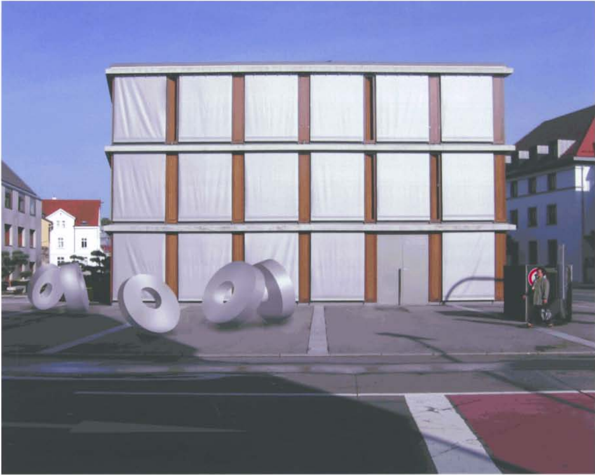
ULMER TOR PLATZ CONCEPT A BRAD HOWE 2007